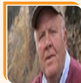
Stuart Mott Dialysis Clinic, Inc - Albany, USA