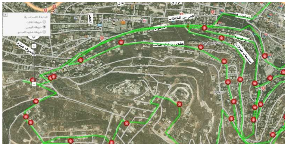
Fig 2. Portion of the optimal solution of the GA, where the red spots represent dumpsters

Regarding time saving in SW collection, from the collected truck GPS data, each truck moves an average of 45 Km/hour, then the saving in the driving time would be about 4.6 hours per truck. That is about 2 hours 19 minutes per truck tour. The processing time (emptying) at each dumpster is the same, so there is not difference between the current situation and the solution obtained by GA.