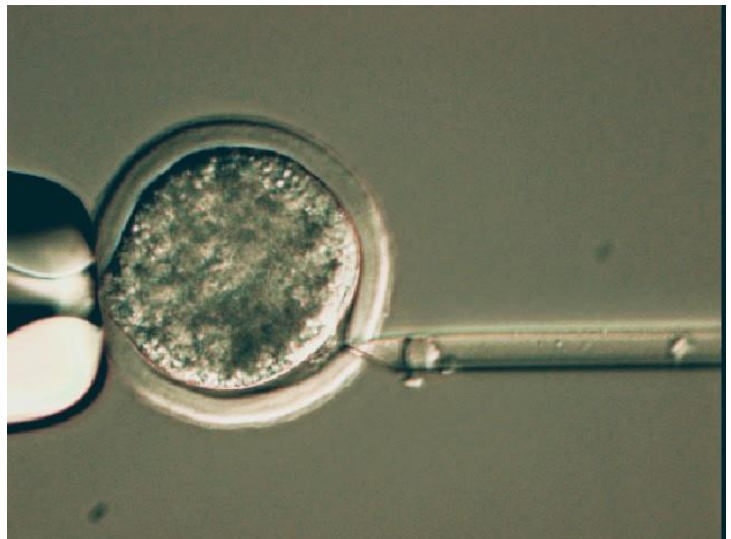
Fig 2. Each donor cell was introduced into a single enucleated oocyte by microinjection pipette. Şekil 2. Donör hücrelerin mikroinjeksiyon pipeti ile eneküle edilmiş oositlerin içine yerleştirilmesi.