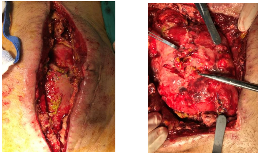
Figure (1): Major breakdown of the laparotomy wound. The small bowel loops seen in the wound are very inflamed and densely adherent with multiple fistula openings.

March 5, 2018, re-exploration was carried out. Many small intestinal serosal rips and injuries were discovered during this laparotomy and mostly healed. This most recent operation was exacerbated by minor intestinal leakage, a ruptured abdomen, and septicemia. The patient was sent to our clinic for additional treatment at this point. On admission, the patient was found to have an open abdomen with severe inflammation and adhesion of fragile bowel with a leak from multiple sites (Figure 1).