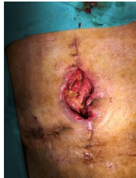
Figure (2): large proximal fistulas failed to recover with non-surgical therapy and remained to leak bile and pancreatic secretions rich fluid in large volumes.

The patient was resuscitated; laparostomy wound care was initiated with sepsis control. Total parenteral nutrition started, and nonoperative therapy continued initially to resolve infection and inflammation and restore the peritoneal cavity. Wound exploration showed that the fistulas involved multiple bowel loops from different levels, including the proximal jejunum. In 3 months of medical management, most small bowel fistulas closed spontaneously, and the laparostomy wound partially closed. However, two large proximal fistulas failed to recover and remained to leak large volumes of succus rich in bile and pancreatic juice. Drains, including suction drains and dressing techniques, could not control these fluids, causing severe skin excoriations and severe fluid-electrolyte disturbances (Figure 2). Furthermore, the patient remained in critical condition with severe malnutrition recurrent septicemia with several multidrug-resistant bacteria; most of these infections were catheter-related. The abdomen was still hard all over, indicating persistent inflammation.