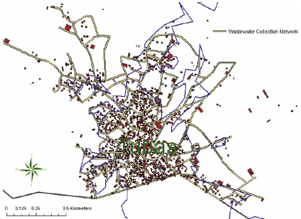
Fig. 1. Proposed sewer collection system for Tubas.